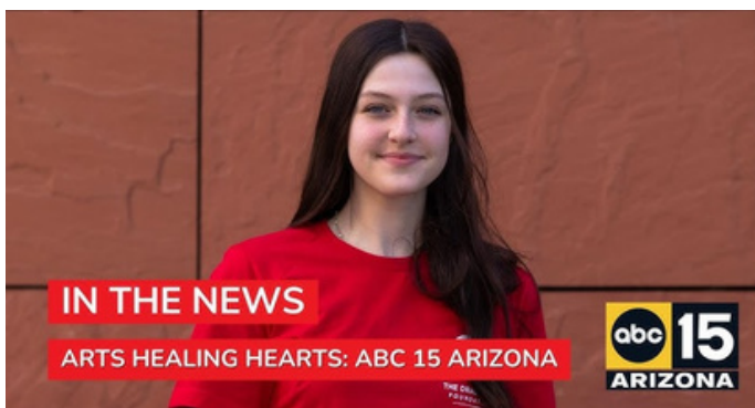
ABC Arizona TV Story on Fellowship Project "Arts Healing Hearts"