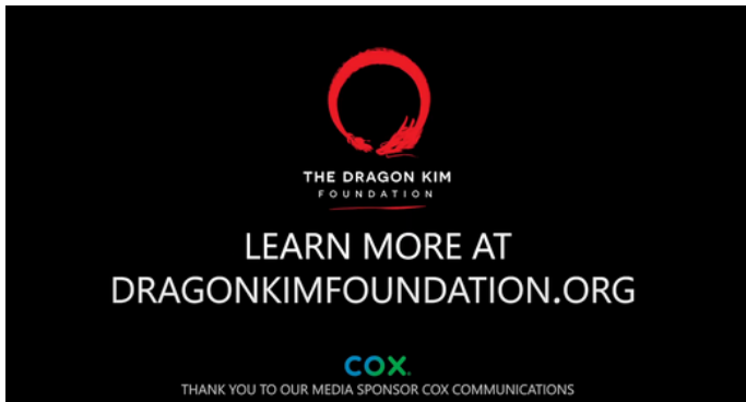
Cox Communications Television Commercial (2024)

Our programs and participants have received significant local and national media coverage. Here are just some of the highlights of 2024, along with our community partners and special events. We're grateful for the chance to bring more awareness to our programs!