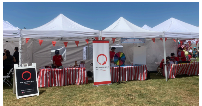
Illumination Foundation Carnival for Kids 2024