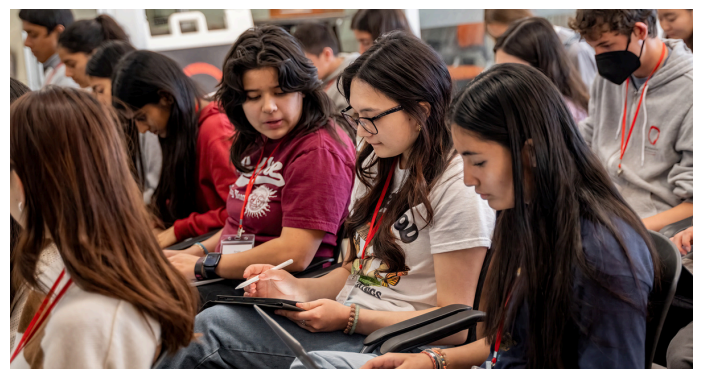
College Writing Workshops