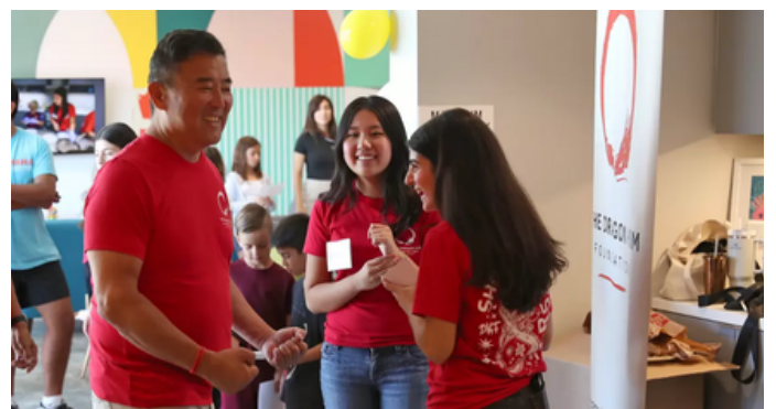
LA Times/Daily Pilot Print Story on Fellowship Project "Feast of Flavors"