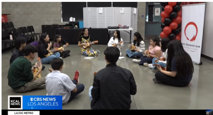
KCAL/CBS News TV Story on the Music Program