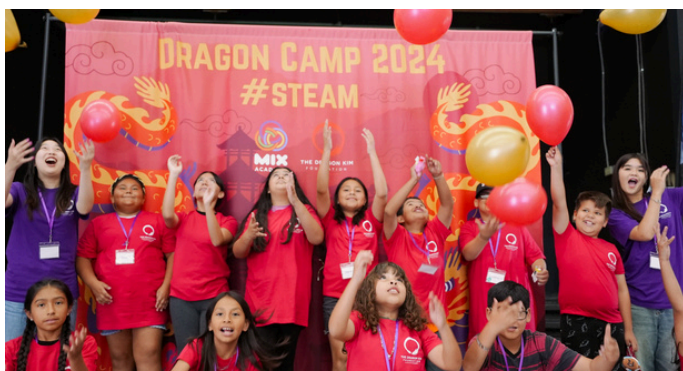
Dragon Camp at the Mix Academy