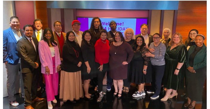
PBS Local Heroes Nominee 2024