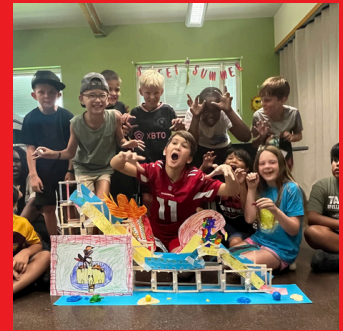
Let's Get the Ball Rolling